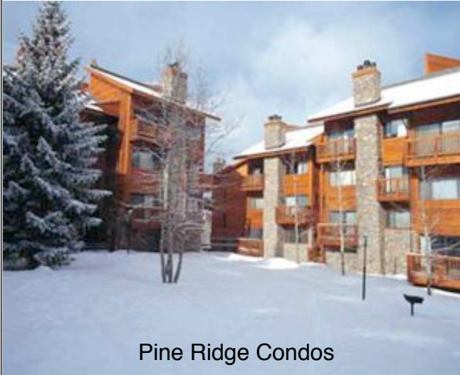
Pine Ridge Condos

The trip is full. A Super Bowl party is being planned. Travel packages will be handed out at the January general meeting.